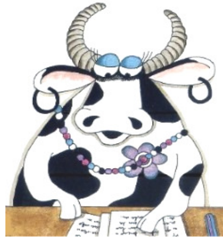
a bonnie coo